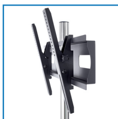
Possibility of tilting the screen from -6^{\circ} to +9^{\circ}