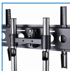
Fully adjustable height