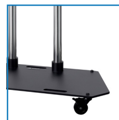
Includes 4 braked casters