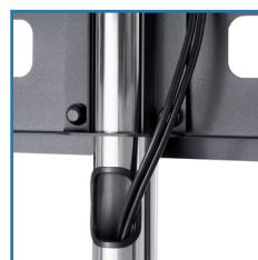
Cable management system