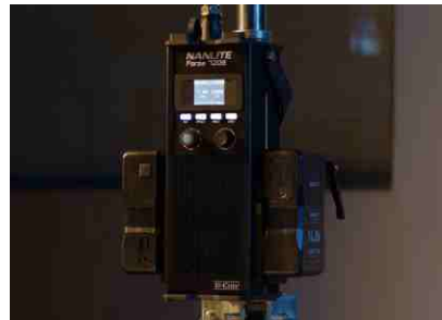
V-Mount Batteries Accessibility