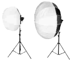
LT-80/LT-120 Lantern Softbox