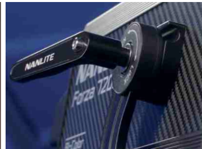
Versatile Umbrella Mount