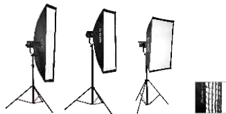
SB-ST-140X30 Strip Softbox SB-AS-110X45 Asymmetric Softbox SB-RT-90x60 Rectangle SoftBox EC-140X30/EC-110X45 Eggcrate (Optional)