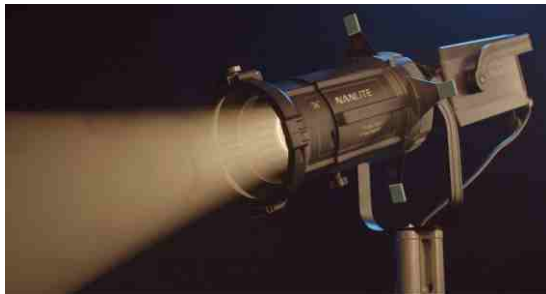
Top-ranking Illuminance Performance