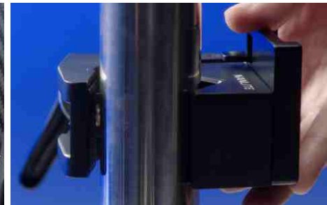
Quick Release Clamp